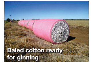
Baled cotton ready for ginning