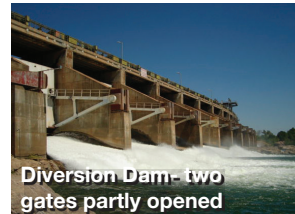
Diversion Dam - two gates partly opened