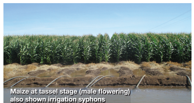
Maize at tassel stage (male flowering) also shown irrigation syphons

Occasionally we organise special destination tours not included in this brochure. Please contact the Kununurra Visitor Centre (08 9168 1177) or Reception at your accommodation in Kununurra for the availability of these tours.