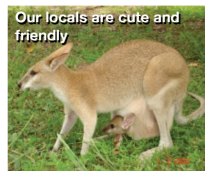
Our locals are cute and friendly