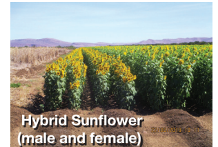
Hybrid Sunflower (male and female)