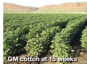
GM cotton at 15 weeks

There may be some minimum numbers on some tours. We pride ourselves on making certain that you, our visitor leaves the area wanting to return for another look.